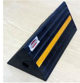
Can be supply in single unit.