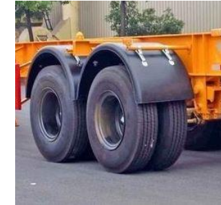
Double layer wheel vehicle (FIG 1)