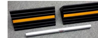
Chock with rod insert